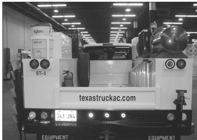
Figure 7: With its on-board welder (left), shop-sized air compressor and plenty of side storage compartments, Texas Truck A/C's custom Ford F-450 is ready for almost repair in the field. The ladder often provides access to components on large off-road vehicles.

On the wide rails of the bed are a 13-horse air compressor and a Miller Bobcat 225 welder-generator. Built into the