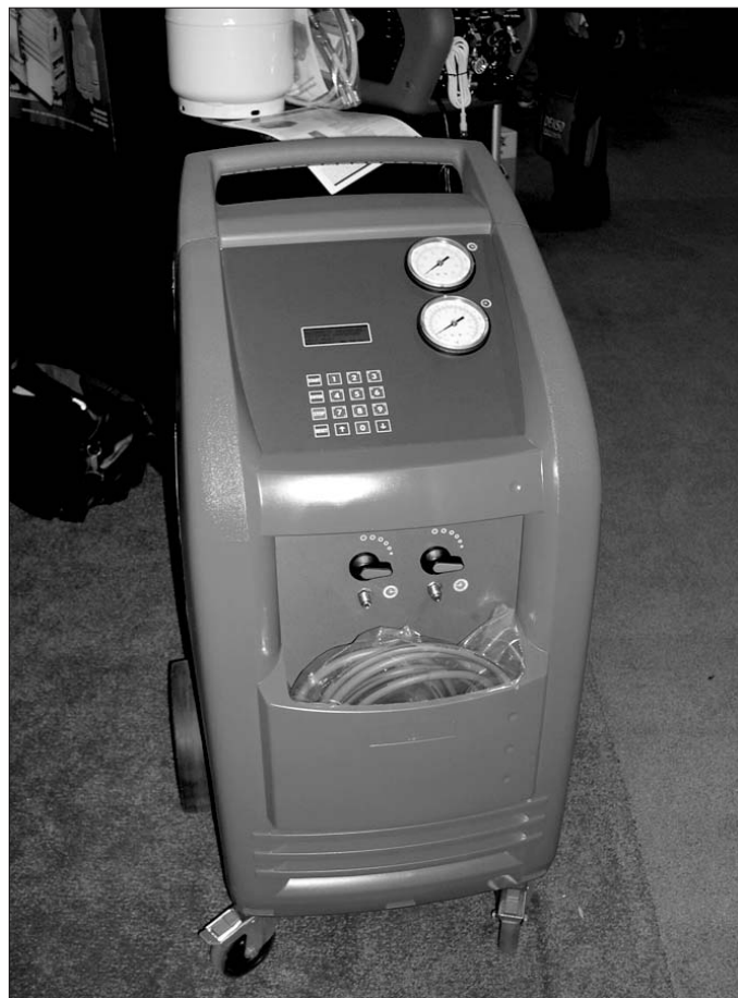
Figure 6: Newest SAE J2788 recovery, recycle and recharge machine was exhibited by Mastercool.

protect the motor windings and maintain high resistance in the refrigeration circuit in case of high-voltage leakage from the motor to the compressor body. That high-voltage fault could pose a danger to technicians.