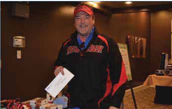
It was a great day of golf with fortunate weather for all who participated. Thursday, MACS recognized six industry leaders with the Mobile A/C Industry Pioneer award.